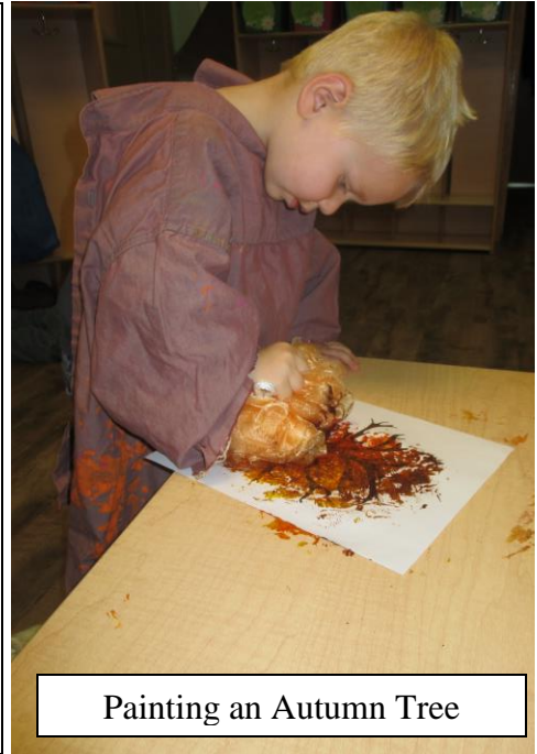
Painting an Autumn Tree