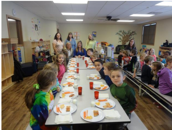
Enjoy your time with your Family

Thursday, Nov. 24th Happy Thanksgiving Friday, Nov. 25th Friday after Thanksgiving Friday, Dec. 23rd Christmas Holiday Monday, Dec. 26th Christmas Holiday Friday, Dec. 30th New Year's Holiday Monday, Jan 2nd New Year's Holiday