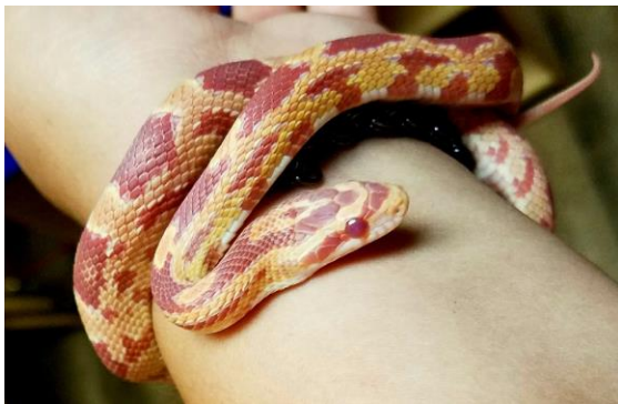
Meet the Explorers new pet snake. Its name is Harvest.