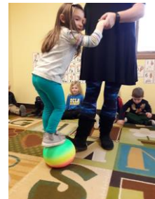
The Explorers practicing their circus acts.