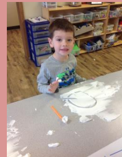
The Rangers practicing their letters

Our Valentine's Day Party will be held on Thursday, February 14 th from 9:00 am – 11:00 am. If your child would like to participate, the children will be exchanging valentines with their classmates. Please have your children sign them with their name only. Do not address them to specific children. We like to have special treats and volunteers for our party. Please see your child's classroom door for a sign-up sheet. The party is open to all students that attend NSEC. If your child does not normally attend on Thursday, they may come for the party time only. Also, the classroom can get quite crowded with the extra attending children, so please respect the 2 chaperone rule per classroom.